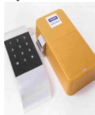
Electronic digital lock