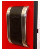
RFID s/s lock