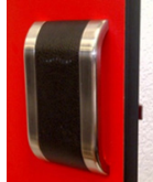
RFID s/s lock