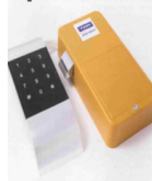
Electronic digital lock