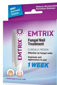
Emtrix Fungal Nail Treatment