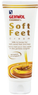
Gehwol Soft Feet Cream with Milk & Honey