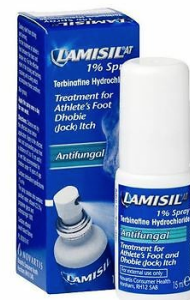
Lamisil 1% Spray