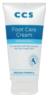
CCS Foot Care